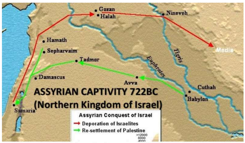
2 Kings 17:6 In the ninth year of Hoshea, the king of Assyria captured Samaria and deported the Israelites to Assyria. He settled them in Halah, in Gozan on the Habor River and in the towns of the Medes.